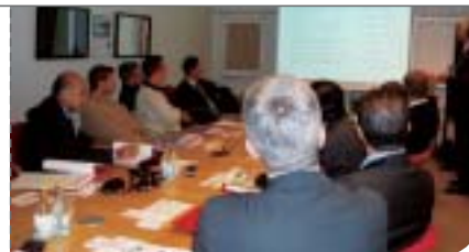
▲ The second European Health, Safety and Environmental Meeting

To strengthen our regional efforts overseas, we began the Occupational Safety and Environmental Affairs Meeting in Europe in 2005 and held the second meeting in 2006. Also in 2006, the personnel in charge of environmental affairs of Komatsu Ltd. conducted inspection tours of manufacturing subsidiaries in China.