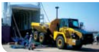
▲ HM300 articulated dump truck ready for shipment from the Port of Hitachinaka, adjacent to the Ibaraki Plant in Japan

Concerning logistics of heavy items, we are continuing our promotion for a modal shift from trucking to marine transportation and railway.