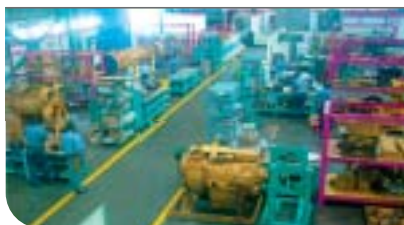
▲ PT Komatsu Remanufacturing Asia, the largest Reman facility of the Komatsu Group

We developed construction and mining equipment compliant with Tier 3 emission standards in the United States, Europe and Japan, effective 2006, including WA500-6 and WA600-6 wheel loaders as well as PC128US-8 and 138US-8 tight-tail-swing hydraulic excavators.