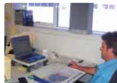
Analyzing VHMS data on a notebook PC in his office