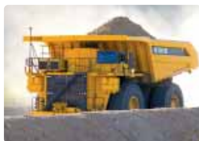
Autonomous haulage system

To this end, we deliver IT benefits, as we support our customers around the world.