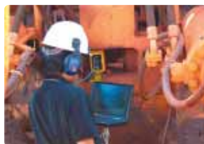
Downloading data from the controller of the Vehicle Health Monitoring System (VHMS), mounted on the equipment