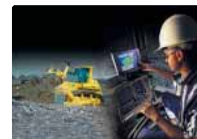
The DISPATCH mine management system developed by Modular Mining Systems, Inc., a wholly owned subsidiary in the U.S.