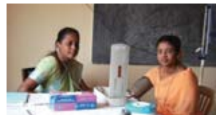
Health examination for women and children of Dyavarahalli