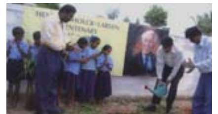
A commemorative tree was planted at the time computers and desks were donated