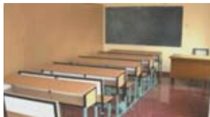
School desks donated by LTK