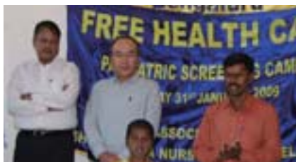
Ceremony marking the commencement of health examinations by LTK Ladies Club in January 2009