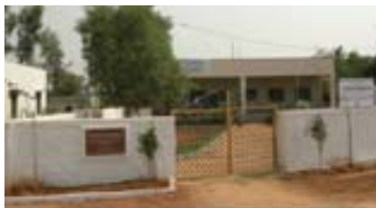
Dyavarahalli School building on which construction work was finished in September 2008

In December 2008, LTK Ladies Club, of which wives of LTK employees are members, was established. The Club conducted health examinations for children who were unable to receive adequate health care due to economic circumstances and for 54 women who live in Dyavarahalli.