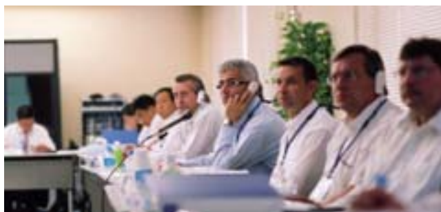
Meeting at the Head Office in Tokyo

The Komatsu Group intends to use this Meeting as an opportunity to form more robust frameworks for exchanges of views at the global level.