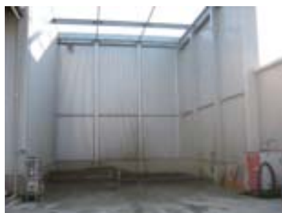
A station for washing vehicles with high walls to minimize the impacts on the surrounding community of the sound and water during washing (Fukuoka Nishi branch of Komatsu Rental Japan Ltd.)

As a result of this assistance, awareness of the environment has risen at agencies and companies and various improvements have been underway.