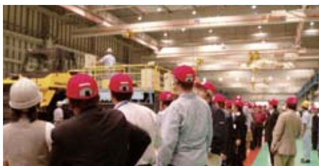
Tour of the Mooka Plant