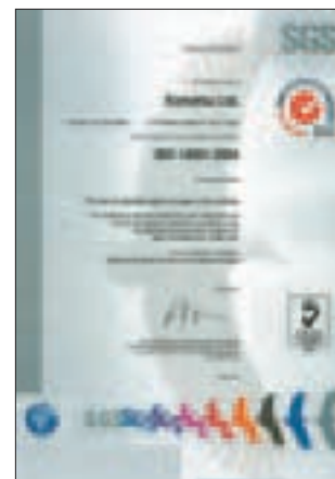
ISO14001 Integrated Certification

Four manufacturing facilities outside Japan, BKI (Bangkok Komatsu Industries Co., Ltd.), KUI (PT Komatsu Undercarriage Indonesia), Hensley (Hensley Industries, Inc.), and KIPL (Komatsu India Pvt. Ltd.) acquired certification in FY2009. Other manufacturing facilities overseas are also being encouraged to acquire ISO certification.