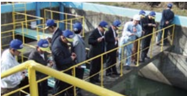
Education and training for personnel in charge of environmental affairs (touring a wastewater processing facility at the Oyama Plant)

At the Oyama Plant, Komatsu clarified environmental conservation guidelines to be upheld across the Group. These guidelines were drawn up based on reporting from both Komatsu Ltd. and Chinese subsidiaries about recent environmental activities as well as the results of surveys conducted at its subsidiaries in 2007. After exchanging views on this topic, participants toured the facilities of the Oyama Plant and nearby related waste recycling businesses. Next