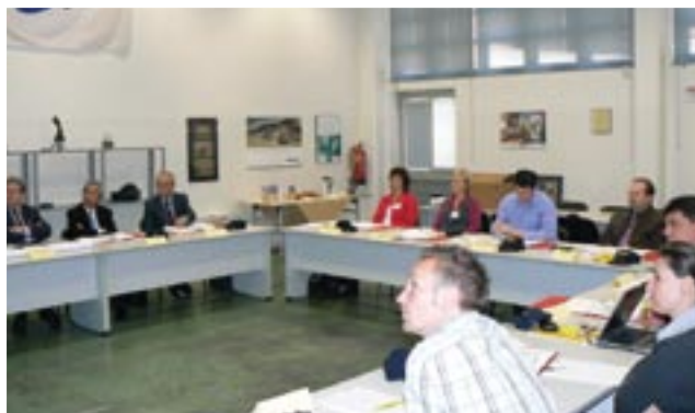
The Third European Health, Safety, and Environment Meeting

To intensify Group-wide information exchanges, the Komatsu Group is planning to convene the Global Safety and Environmental Affairs Meeting in Tokyo in September 2008, with personnel from Asia, the Americas, and other regions also participating.