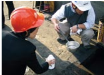
Giving guidance on separation chamber maintenance

Komatsu provides support for these agencies and companies to improve in the areas of safety and the environment by organizing safety promotion activities when industrial accidents occur and by distributing a Safety and Environment Newsletter . As a result, an awareness of the environment has thoroughly permeated these workplaces and various improvements have been seen.