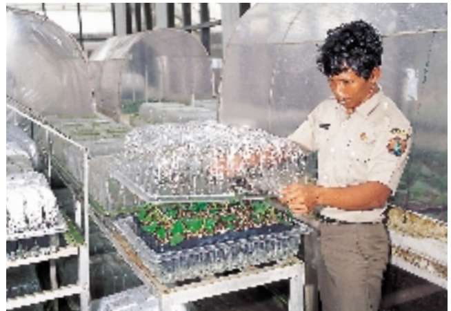
Seedling Laboratory (Indonesia)

The Komatsu Green Fund was established in 1991. Through it the company makes various social contributions, especially on behalf of environmental preservation, providing one percent of the company's recurring profits as the lower limit of funding. In addition to beautification projects such as the ongoing support for the Flower Association of Japan and our own Floral Komatsu program, which encourages employees to plant flowers around their manufacturing facilities, we are engaged in a project to restore a tropical forest in Indonesia as part of our earth greening activities.